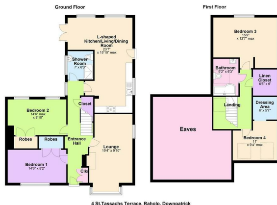
4 St. Tassachs Terrace, Raholp, Downpatrick

Terms & Conditions: Please note that these particulars do not constitute an offer or contract of sale. Any prospective purchaser should satisfy themselves by thorough inspection of the property and we recommend that any prospective purchaser should employ the professional services of a building surveyor and consider their findings prior to entering into contract. All such fees associated with this work will be the responsibility of the prospective purchaser regardless of whether the sale completes or not. In addition, none of the appliances or installations have been tested in any way whatsoever and it is our recommendation that a purchaser should fully satisfy themselves by employing an appropriate expert. We would also like to advise that our measurements are taken from the widest points of each room and should not be relied upon as completely accurate. You should not make decisions based on the measurements provided and double check measurements at all times. Valuation/Mortgage Service: As part of our service we would remind Vendors and potential purchasers that we have a Mortgage Broker available at this branch. If you are thinking of selling, we would be happy to carry out a free market appraisal of your property.