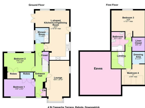
4 St. Tassachs Terrace, Raholep, Downpatrick

Terms & Conditions: Please note that these particulars do not constitute an offer or contract of sale. Any prospective purchaser should satisfy themselves by thorough inspection of the property and we recommend that any prospective purchaser should employ the professional services of a building surveyor and consider their findings prior to entering into contract. All such fees associated with this work will be the responsibility of the prospective purchaser regardless of whether the sale completes or not. In addition, none of the appliances or installations have been tested in any way whatsoever and it is our recommendation that a purchaser should fully satisfy themselves by employing an appropriate expert. We would also like to advise that our measurements are taken from the widest points of each room and should not be relied upon as completely accurate. You should not make decisions based on the measurements provided and double check measurements at all times. Valuation/Mortgage Service: As part of our service we would remind Vendors and potential purchasers that we have a Mortgage Broker available at this branch. If you are thinking of selling, we would be happy to carry out a free market appraisal of your property.