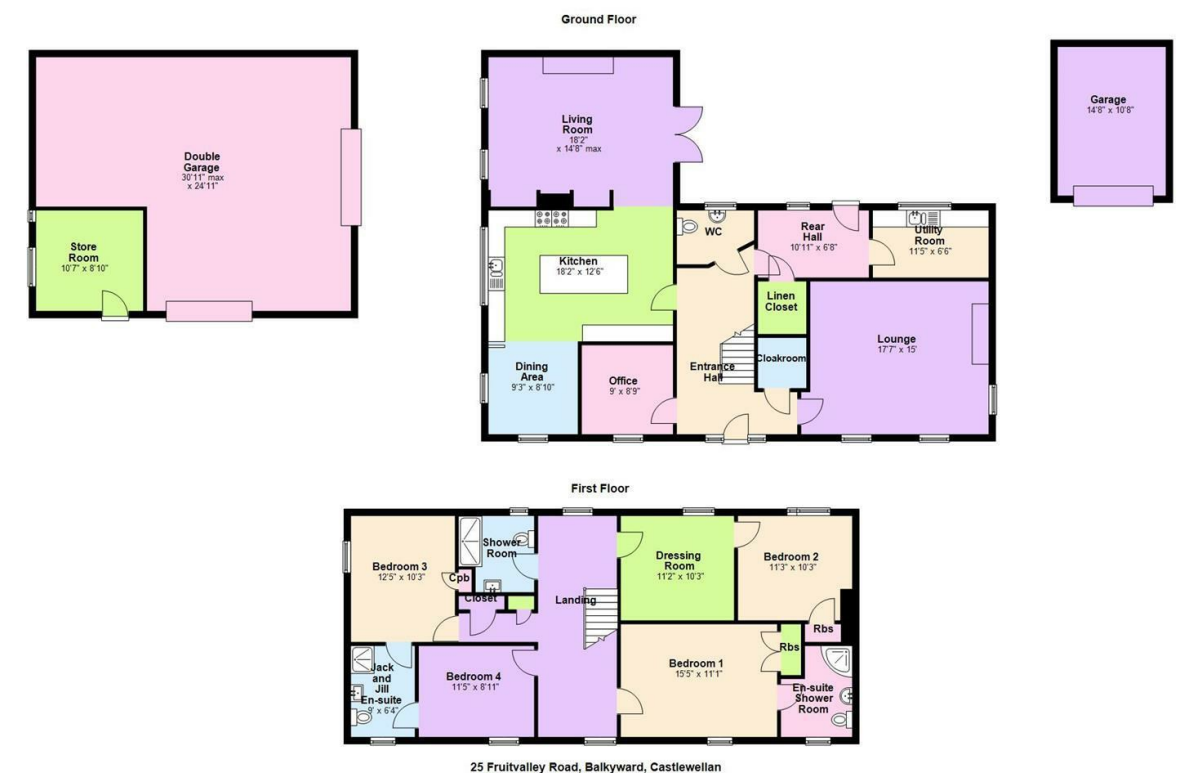
25 Fruitvalley Road, Ballyward, Castlewellan

If you require a viewing please get in contact via phone Leanne on 02840622226/07703612260 or email - banbridge@quinnestateagents.com