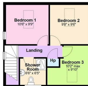
6 Ashburn, Ballynahinch

Terms & Conditions: Please note that these particulars do not constitute an offer or contract of sale. Any prospective purchaser should satisfy themselves by thorough inspection of the property and we recommend that any prospective purchaser should employ the professional services of a building surveyor and consider their findings prior to entering into contract. All such fees associated with this work will be the responsibility of the prospective purchaser regardless of whether the sale completes or not. In addition, none of the appliances or installations have been tested in any way whatsoever and it is our recommendation that a purchaser should fully satisfy themselves by employing an appropriate expert. We would also like to advise that our measurements are taken from the widest points of each room and should not be relied upon as completely accurate. You should not make decisions based on the measurements provided and double check measurements at all times. Valuation/Mortgage Service: As part of our service we would remind Vendors and potential purchasers that we have a Mortgage Broker available at this branch. If you are thinking of selling, we would be happy to carry out a free market appraisal of your property.