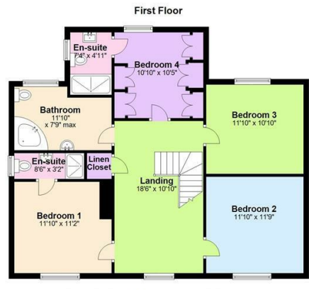
9 The Gallops, Lurganure Road, Lisburn