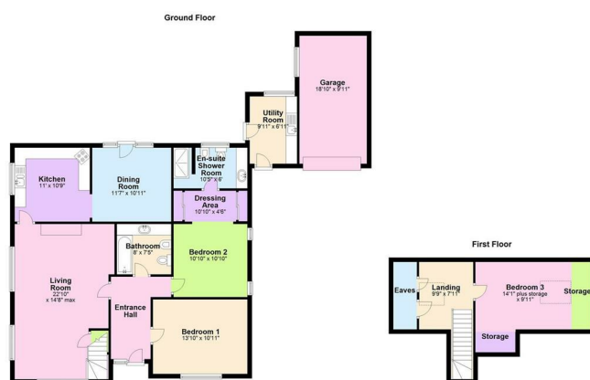
31 Dunmore Road, Spa

Terms & Conditions: Please note that these particulars do not constitute an offer or contract of sale. Any prospective purchaser should satisfy themselves by thorough inspection of the property and we recommend that any prospective purchaser should employ the professional services of a building surveyor and consider their findings prior to entering into contract. All such fees associated with this work will be the responsibility of the prospective purchaser regardless of whether the sale completes or not. In addition, none of the appliances or installations have been tested in any way whatsoever and it is our recommendation that a purchaser should fully satisfy themselves by employing an appropriate expert. We would also like to advise that our measurements are taken from the widest points of each room and should not be relied upon as completely accurate. You should not make decisions based on the measurements provided and double check measurements at all times. Valuation/Mortgage Service: As part of our service we would remind Vendors and potential purchasers that we have a Mortgage Broker available at this branch. If you are thinking of selling, we would be happy to carry out a free market appraisal of your property.