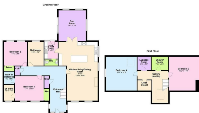
43A Saintfield Road, Ballynahinch